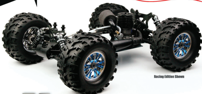
Racing Edition Shown